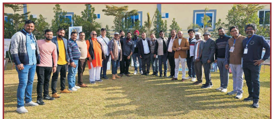
A Tapestry of Talent : Eminent Artists United in Creativity and Culture

Convenor, National Residential Art Camp 2024